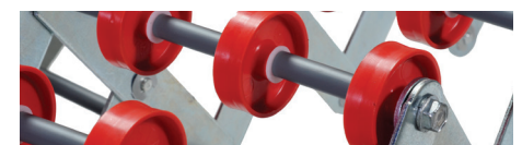
RED POLY SKATE WHEELS WITH NYLON BUSHINGS

800.327.9209 | FMHSALES@FMHCONVEYORS.COM | WWW.FMHCONVEYORS.COM