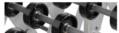
BLACK POLY SKATE WHEELS WITH STEEL BALL BEARINGS