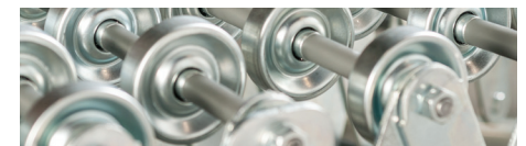
STEEL SKATE WHEELS WITH STEEL BALL BEARINGS

Technical Support Installation & Setup Service Maintenance Application Support Hardware Support